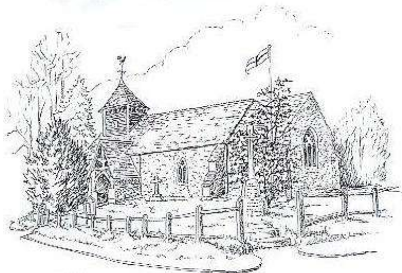
St Andrew's Church

Many will see St. Andrew's for its historical and architectural value, as a building which enhances the character of our village. It is used by nearly all villagers at some time for weddings, baptisms and funerals, as well as for regular church worship.